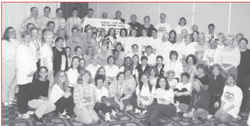
An Awesome Experience: Runners from ten Wellness Communities participated in the Strides for Hope Marathon in New Orleans.

We joined participants from ten Wellness Communities around the country, which was really special, as